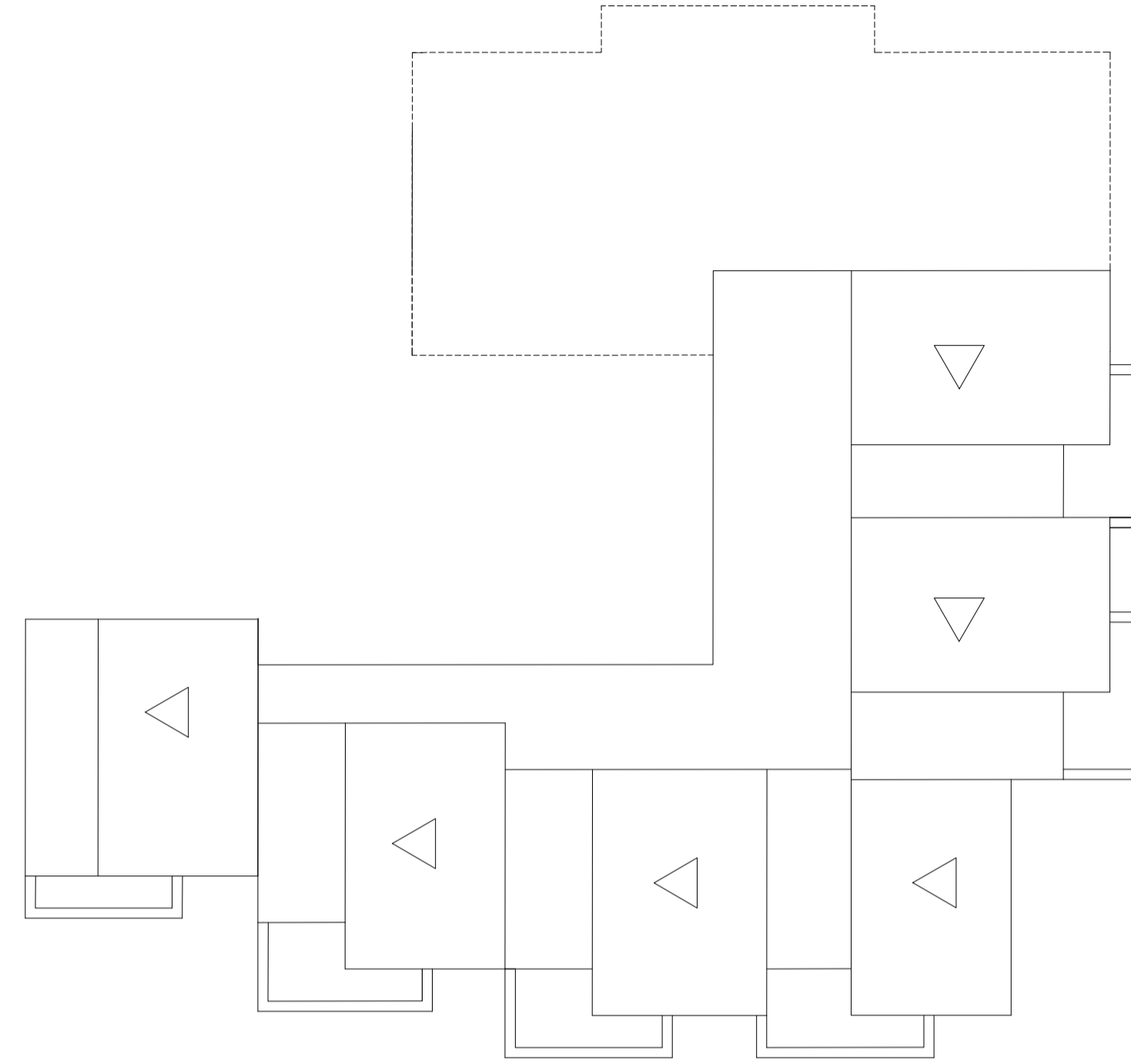
Proposed Roof Plan Scale 1:200